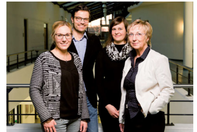
The "Sustainable Social Policy" team